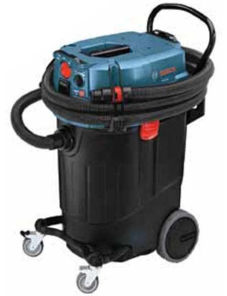
The 14-gallon Bosch VAC140A dust extractor self-cleans its filter through a reverse airflow every 15 seconds during operation without compromising suction or performance.

with all Bosch vacuum cleaners can be securely attached to dust collection guards and shrouds with either the friction-fit power tool adapter or clicked together with the quick-connect system.