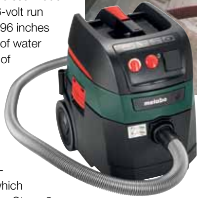
The nine-liter Metabo ASR 35 dust extractor features Auto Clean Plus, which monitors suction levels and automatically cleans the filters whenever suction drops. It also features power tool activation.

efficiency,” Derché adds. “In particular, we have developed unmatched performance in tuckpointing, cutting/scoring, drilling and grinding for the perfect integration of the vacuum, shroud, grinder or hammer and the diamond or carbide.”